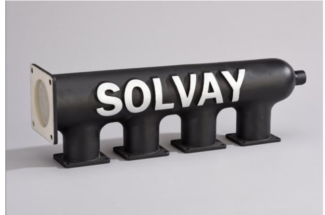
3D printed plenum chamber fabricated with Solvay's Sinterline ® Technyl ® PA6 powders.