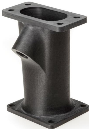
Fuel intake runner for the Polimotor 2 all-plastic engine, 3D printed in a reinforced Filament Fusion process using 10 percent glass filled KetaSpire ® PEEK polymer.